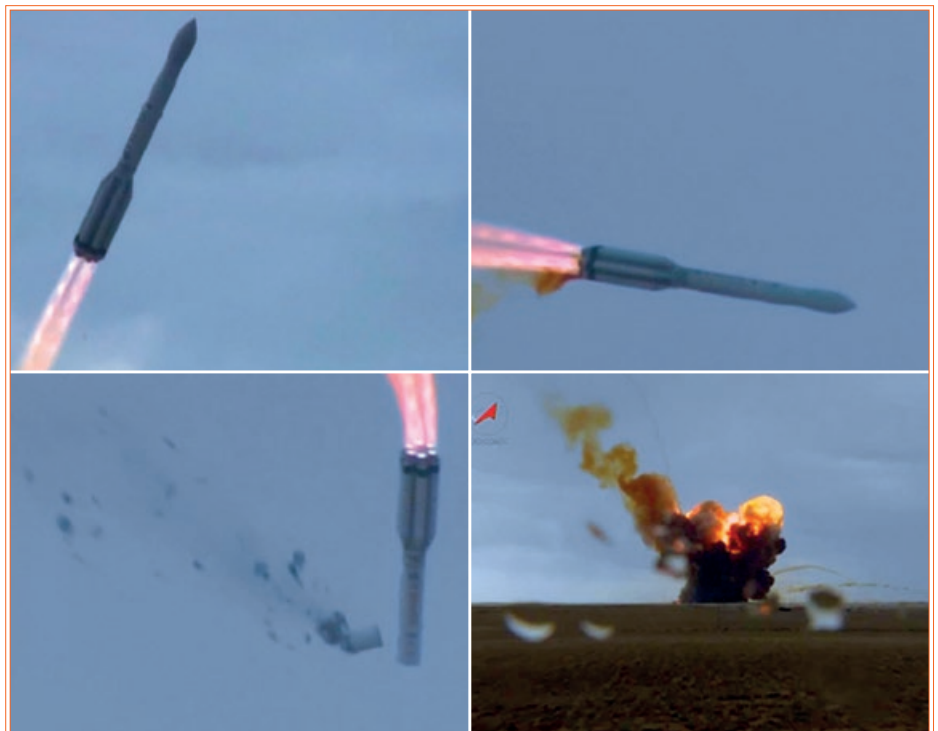
Confused by upside down sensors, a Proton-M launched on July 2 was airborne for only seconds before it crashed back to the ground.

The commission plans to recommend photographic documentation throughout the rocket assembly process, a step that has recently been implemented for Breeze-M manufacture in response ▶▶